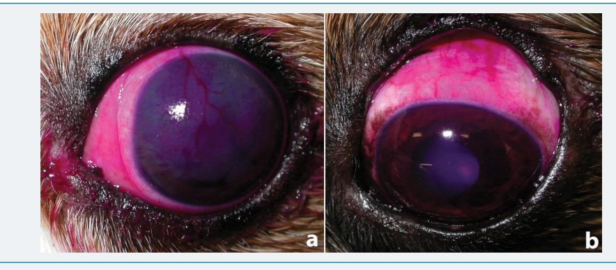
Figure 1: Rose Bengal staining of conjunctiva and cornea in two dogs with KCS. a) 8 year old Cavalier King Charles spaniel with STT of 4mm/min and staining both of conjunctiva and cornea together with corneal haze and neovascularisation. b) 7 year old Cross-bred dog with STT of 9mm/min and staining confined to the conjunctiva.

It can be seen from Figure 1that the spread of results appears broader at the lowest STT results. For this reason a further analysis was undertaken to separate groups into those with STTs at 5mm/min and above, and those below. For STT values below 5mm/min analysis showed a moderate negative correlation (Pearson's correlation coefficient, R: -0.62, R<sup>2</sup>: 0.39, P=0.00013). As can be appreciated from graph in figure 1, the spread of results appears 5, R:-0.068 (not significant at P<0.05), whereas for those at 5 or above, R: -0.82, P=0.000026). The sample size was too small to examine whether significant differences in Rose Bengal staining were noted between different breeds or age groups was found and such work awaits further research.