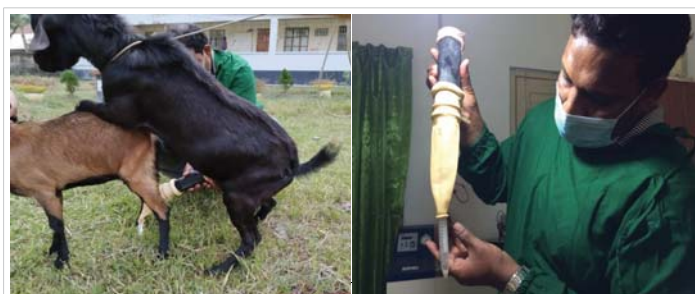
Figure 1: Semen collection from bucks by AV and semen evaluation in the lab.

The semen was collected at oestrus doe mount by artificial vagina (AV) method once a week (Figure 1). The bucks were allowed at least one to two false mounts before the collection of semen. The preputial sheath of the buck was lightly grasped and deviated into the AV in its final mount. Immediately after collection, the collecting tube was detached from the AV,